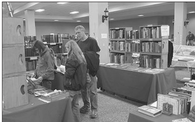
2012 spring book fair in Burlington

Saturdays and evenings or by appointment. We are mostly closed November through March but will open anytime by appointment. Call 291-0842.